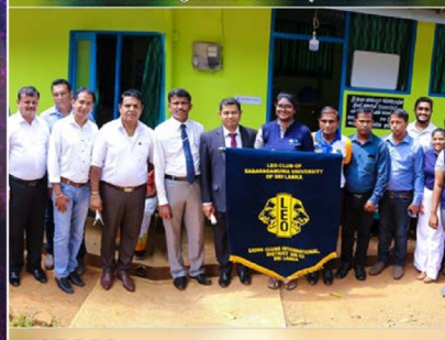
Project Singithma Leo Club of Sabaragamuwa University of Sri Lanka

The project "Singithma" principally focused on reopening a Maternity Clinic located in the area called Pambahinna, Belihuloya which had been closed for more than 10 years. Hence, the reopening of this particular Maternity Clinic opened the doors for a greater number of individuals to ensure their necessities being satisfied. We decided to conduct a shramadana campaign and an exclusive repairing process in order to reconstruct this recognized Maternity Clinic in an acceptable manner with the involvement of club members. Adequate funds were raised with the help of the public and sponsorships in purchasing required equipment and renovating the whole building along with its premises. Finally, we were able to successfully reopen this Maternity Clinic on 6th April 2021 with the participation of the Leos of Sabaragamuwa University, guests, and the pregnant mothers living within that village. All the guests and pregnant mothers, at last, presented their appreciation to Sabra Leos for making an immense contribution to reopen this Maternity Clinic. This was a great opportunity for the club to convince how Leos are committed and passionate about working on extraordinary projects like this.