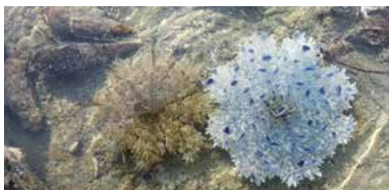
Upside-down jellyfish found in Jaffna Peninsula (as a good bio-indicator for water pollution and as an ornamental species)