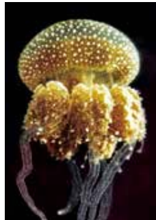
An ornamentally valuable species (Australian spotted jellyfish) found in northeast coast of the country