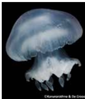
A potentially exportable species (Sand-type jellyfish) for food