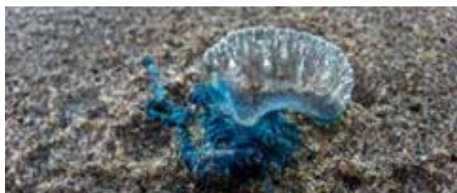
A commonly found hazardous jellyfish species (Portuguese man of war) along the southwest and northeast coasts during respective monsoonal periods