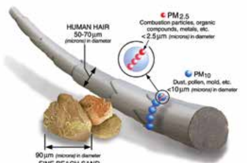
Size comparison of particles compared to a human hair

Under measures to control the spread of coronavirus, the world became a more “slowed down” place with curfew imposed, industries and factories closed, social movement restricted and transportation brought to a halt. According to a global report, road and aviation transport was almost 50% and 60% below the 2019 average, respectively. As a result air quality throughout the world has improved considerably. Air pollution in the cities are mainly coming out of vehicles and can mainly be divided into two components, that is, gas and particles. Gases include, CO 2 , CO, oxides of Nitrogen, oxides of Sulphur and many more. Particle air pollution is mainly caused by tiny particles which are less than 2.5 µg in diameter, commonly known as PM 2.5 . These tiny particles, invisible to naked eye and much smaller than a human hair are capable of going deep into lungs and causing diseases.