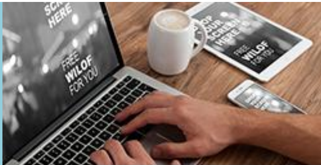
Computing & Information Systems

Agribusiness Management Agricultural Environment & Resource Management Animal Bio-resource Management Aquatic Bio-resource Management Crop Improvement & Plant Protection Crop Production Technology Food Business Management