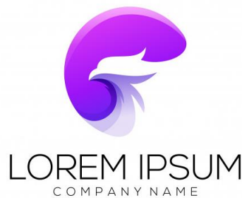
Figure 2.1: Logo

Lorem Ipsum is simply a dummy text of the printing and typesetting industry. Lorem Ipsum has been the industry's standard dummy text ever since the 1500s when an unknown printer took a galley of type and scrambled it to make a type specimen book. It has survived not only five centuries, but also the leap into electronic typesetting, remaining essentially unchanged. It was popularized in the 1960s with the release of Letters sheets containing Lorem Ipsum passages, and more recently with desktop publishing software like Aldus PageMaker including versions of Lorem Ipsum.