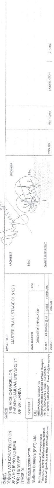
1 MASTER PLAN Scale 1:2000 @ A2